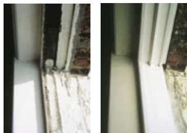
Before & After Cill Renovation

Where any timbers are beyond repair, they will be replaced without delay. New components will be produced in our own workshop that exactly replicate the originals. Renovation is completed with the renewal of all sash cords, servicing of the sash pulleys and careful adjustment of the sash weights to ensure a "like new" operation of the window.